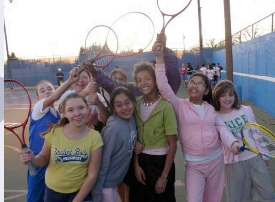
After School Tennis